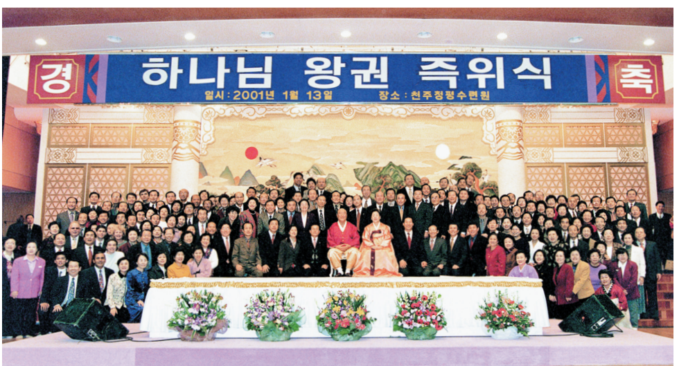
Father and Mother and the attendant couples after the ceremony

The time will come when the president will present an award in a family's home. There are three relationships, those of parent and child, husband and wife, and among the children. Brother-sister relationships are a consequence of the harmony of all these relationships. Therefore, whether in a brother-sister relationship or children's relationship, to become a person standing in the position of subject, you influence others